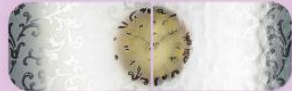
Pilkington Oriel Brocade™

With a superb range of designs, together with diffused glass options for each design, this premium range of etched glass adds a touch of style and elegance to your home.