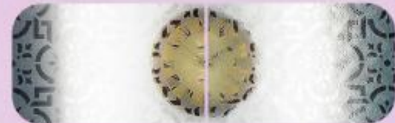
Pilkington Oriel Canterbury™