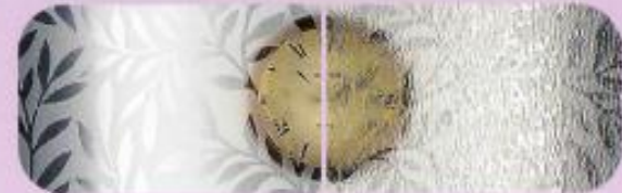
Pilkington Oriel Laurel™