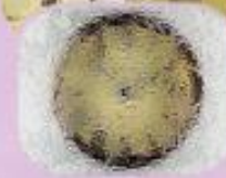
Pilkington Oriel Coppice™